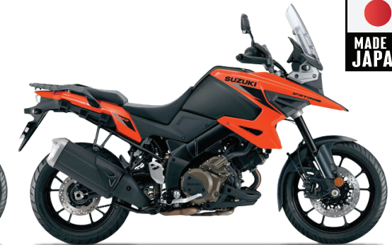
Glass Blaze Orange / Metallic Mat Black No.2 (CGH)