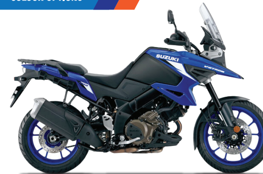
Pearl Vigor Blue / Metallic Mat Black No.2 (CGI)